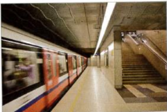
4. a subway