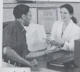
e. a bank