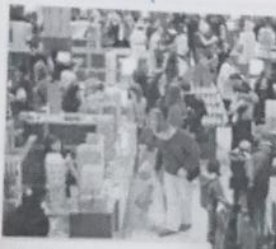
d. a department store