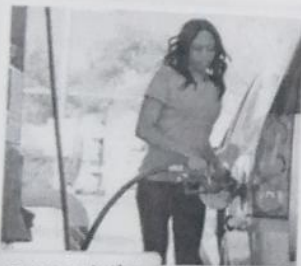
c. a gas station