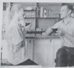
g. a coffee shop