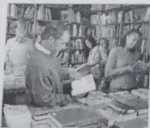
f. a bookstore