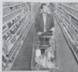
h. a supermarket