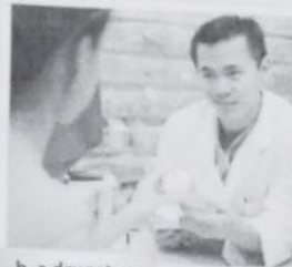
b. a drugstore