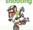
downhill mountain biking