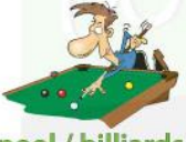
pool / billiards