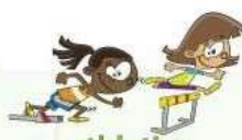
athletics (track and field)