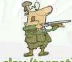
clay (target) shooting