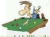
pool / billiards