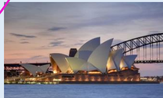
SYDNEY 10:40 A.M.

It's a quarter after seven in the morning.