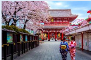
TOKIO 8:08 A.M.