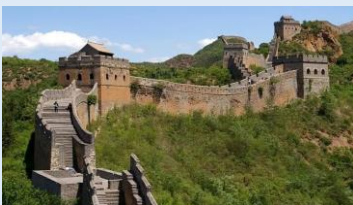
CHINA 7:15 A.M.

It's a quarter after seven in the morning.