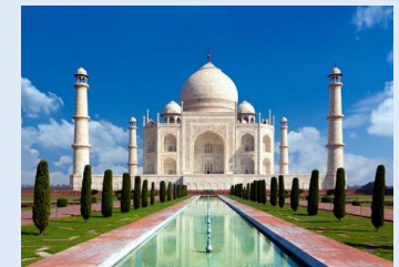
INDIA 5:00 A.M.