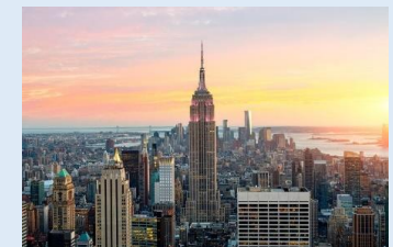
NEW YORK 6:45 P.M.

It's a quarter to seven in the afternoon.