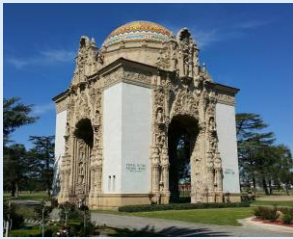
CALIFORNIA 3:30 P.M.