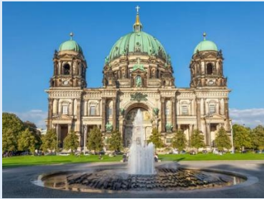
BERLIN 12:15 A.M.

It's twenty-four to one in the afternoon.