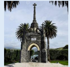
NEW ZEALAND 12:34 P.M.

It's twenty-four to one in the afternoon.