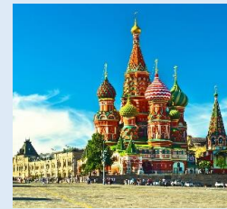
RUSSIA 2:07 A.M.