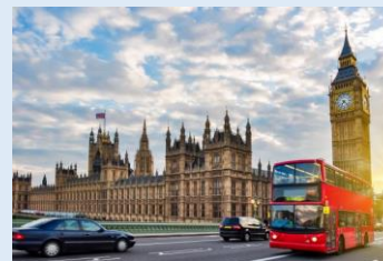
LONDON 11:00 P.M.