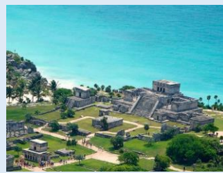
MEXICO CITY 5.35 P.M.