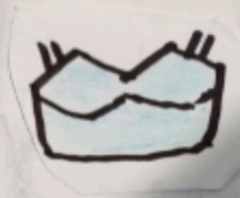
A light blue top.