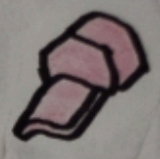
A pink cap.