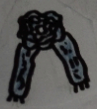
A blue scarf.