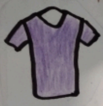
A purple t-shirt.