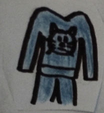
A blue Pajama.