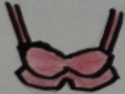
A red bra.