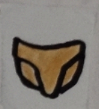
An Orange Panties.