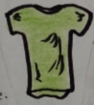
A light green blouse.