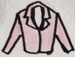
A pink jacket.