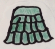
A green skirt.