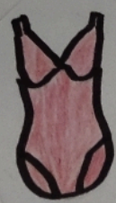
A Red swimsuit.