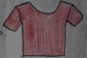
A red crop top.