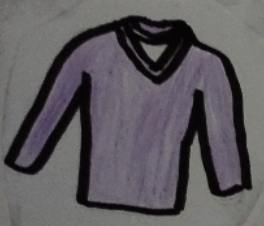
A Purple sweater.