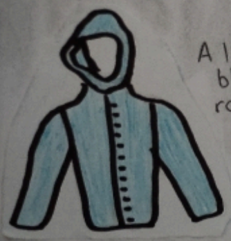
A light blue raincoat.