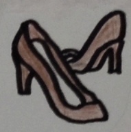
Brown high heels.