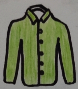
A Green shirt.