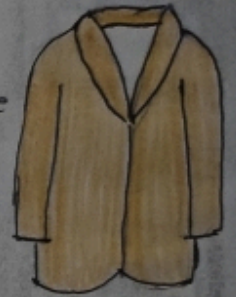
An orange coat.