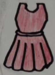
A red dress.