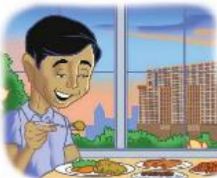
Bangkok 7:00 P.M.