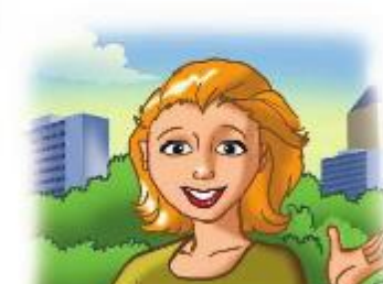
Your city 00:00