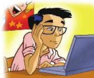
Tokyo 9:00 P.M.