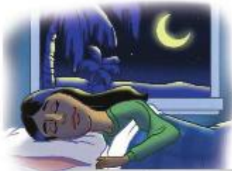
Los Angeles 4:00 A.M.