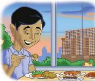
Bangkok 7:00 P.M.