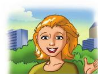
Your city 00:00