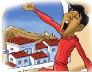
Mexico City 6:00 A.M.