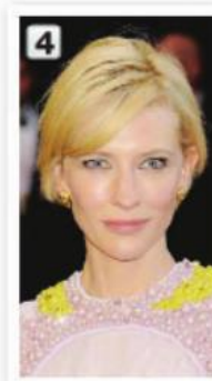
4 Cate Blanchett