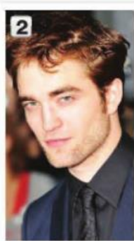
2 Robert Pattinson