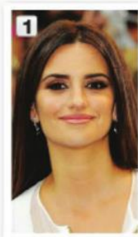
1 Penelope Cruz

A Where are these people from? Check (✓) your guesses.