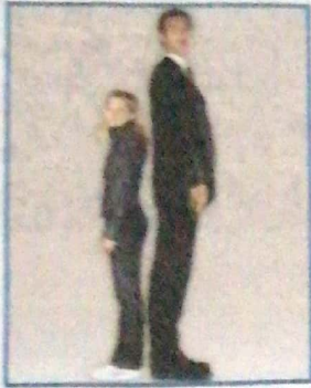
1. short 2. tall