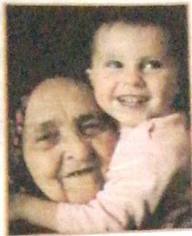
3. old 4. young