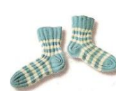
2. a. wool socks