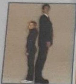
1. short 2. tall