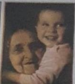
3. old 4. young