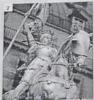
The statue of Joan of Arc in Paris

He was born in Mazovia in Poland in 1810. When he was seven years old he was already a brilliant pianist. He was a great composer and his piano music is world-famous and very popular.