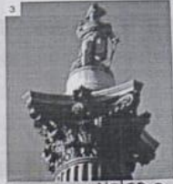
The statue of Nelson in London

She was born in 1412 in the village of Domrémy in France . She was only a young girl but she was also a soldier and a famous leader in the war against the English.