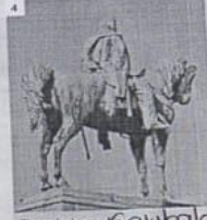
The statue of Garibaldi in Rome

He was born in Norfolk, England in 1758. He was a great sailor. He was famous for his victory against the French at the Battle of Trafalgar in 1805. His statue is in Trafalgar Square.