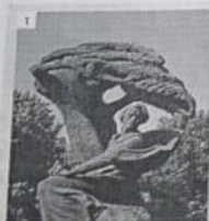
The statue of Chopin in Warsaw

Nelson Garibaldi Chopin Joan of Arc Rome Warsaw Paris London