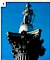
The statue of Nelson in London

She was born in 1412 in the village of Domrémy in France. She was only a young girl but she was also a soldier and a famous leader in the war against the English.