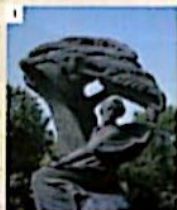
The statue of Chopin in Warsaw

Nelson Garibaldi Chopin Joan of Arc Rome Warsaw Paris London