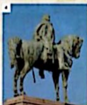
The statue of Garibaldi in Rome

He was born in Norfolk, England, in 1758. He was a great sailor. He was famous for his victory against the French at the Battle of Trafalgar in 1805. His statue is in Trafalgar Square.