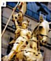
The statue of Joan Of Arc in Paris

He was born in Mazovia in Poland, in 1810. When he was seven years old he was already a brilliant pianist. He was a great composer and his piano music is world famous and very popular.