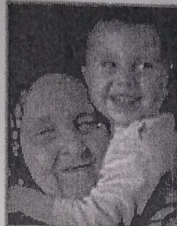
3. old 4. young