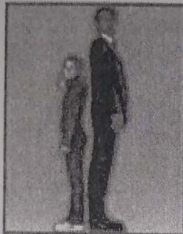
1. short 2. tall

a) 33 Read and listen. Then listen again and repeat.