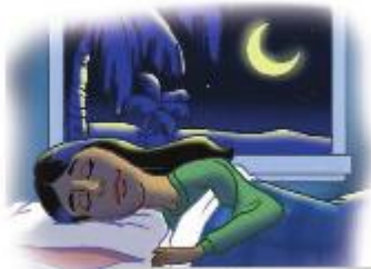
Los Angeles 4:00 A.M.