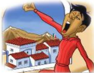
Mexico City 6:00 A.M.