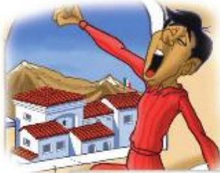
Mexico City 6:00 A.M.