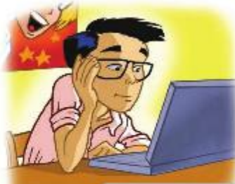
Tokyo 9:00 P.M.