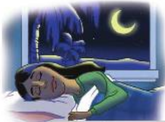
Los Angeles 4:00 A.M.