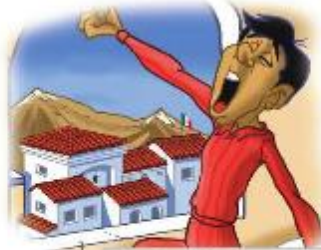
Mexico City 6:00 A.M.