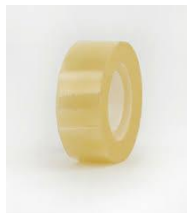
There is a tape