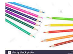
There are eleven colored pencil