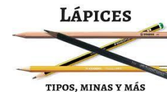
There are four pencil