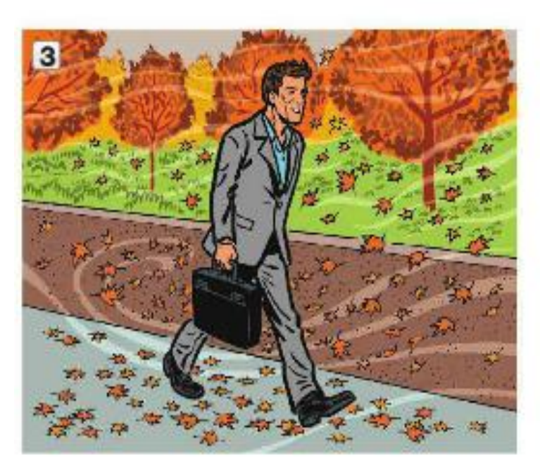
Phil ______ Is wearing a suit today – he is wearing ts and a jacket. He ______ a light blue shirt, but he ______ Is not wearing.