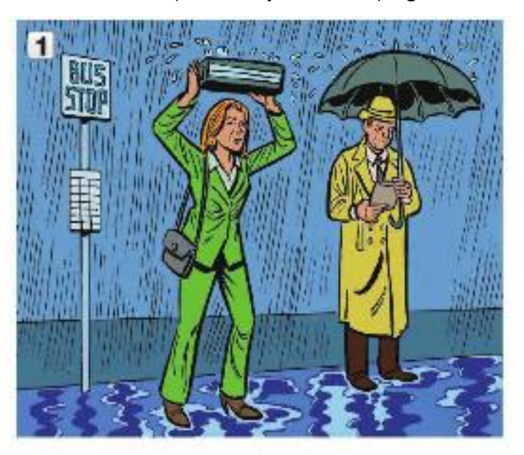
My name is Claire. I im wearing a green suit today. I Am wearing high heels, too. It's raining, but I am not wearing