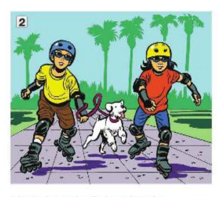
It's very hot today. Toshi and Noriko are wearing shorts and T-shirts. It's really sunny, so they sunglasses. are wearing