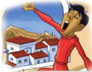
Mexico City 6:00 A.M.