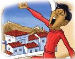
Mexico City 6:00 A.M.