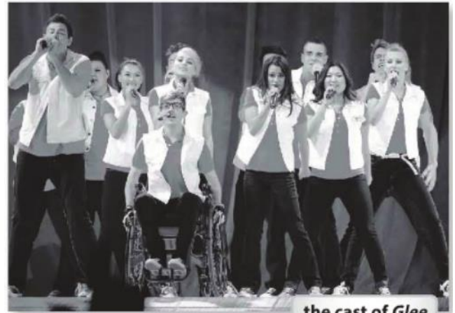
the cast of Glee