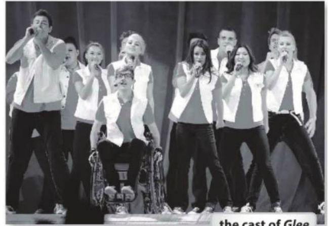
the cast of Glee