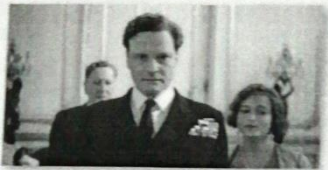
3. Colin Firth is an actor