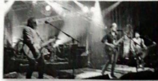
2. The Kings of Leon are a rock band