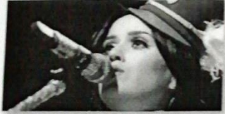
1. Katy Perry is a singer