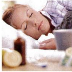
2. lie down