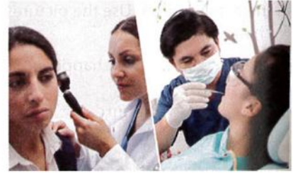
4. see a doctor/ see a dentist