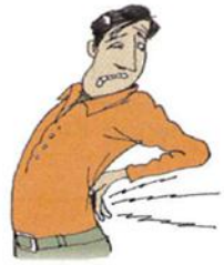
5. a backache