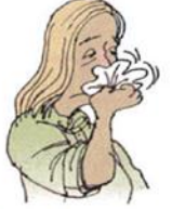
10. a runny nose

Exercise 2. Translate to Spanish the vocabulary above. Traduce al español el vocabulario de arriba.