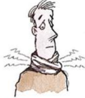
7. a sore throat