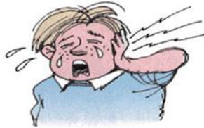
3. an earache