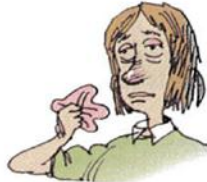
6. a cold