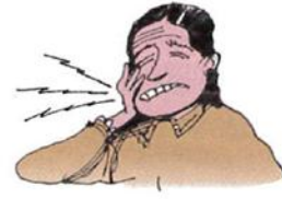
4. a toothache