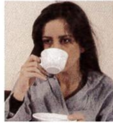
3. have some tea