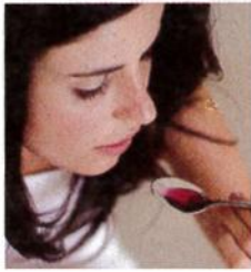
1. take something