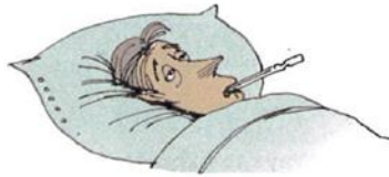
8. a fever