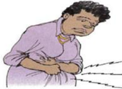
2. a stomachache