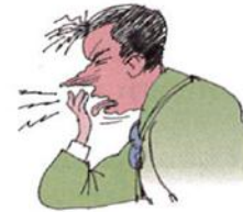
9. a cough