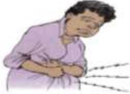
2. a stomachache