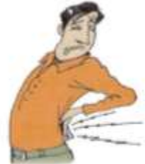
5. a backache