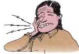
4. a toothache