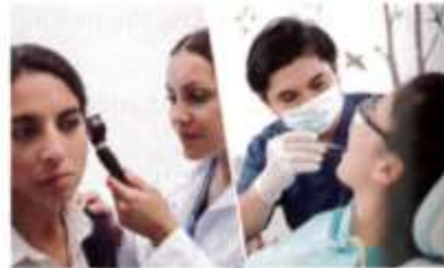
4. see a doctor/ see a dentist