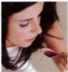
1. take something