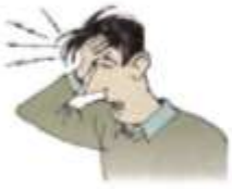
1. a headache