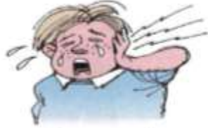
3. an earache