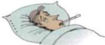
8. a fever