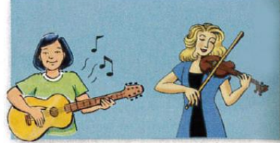
4. play the guitar/ the violin