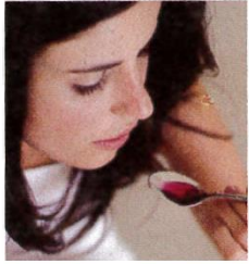
1. take something