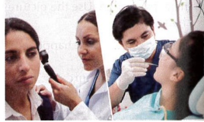
4. see a doctor/ see a dentist