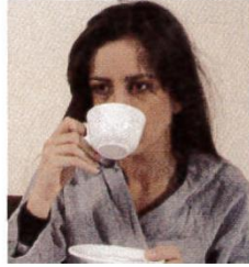
3. have some tea