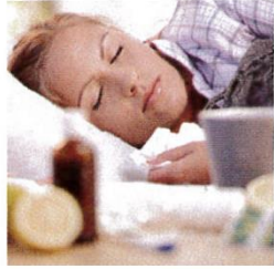
2. lie down