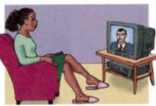
11. watch TV