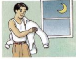
12. get undressed