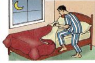
14. go to bed