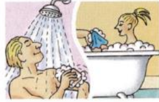
13. take a shower / a bath