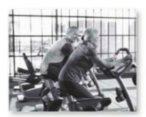
They're going to go to the gym.

A What are these people going to do next weekend? Write sentences.