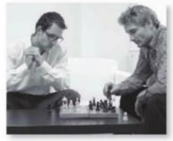
They are going to play chess.