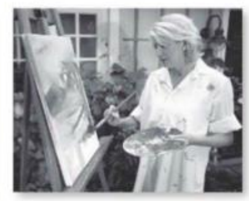
6. She's going to paint