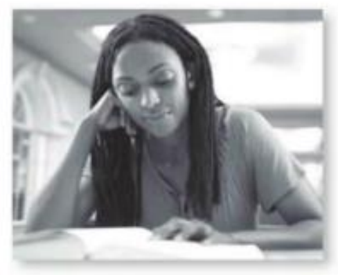
She's going to study hard.