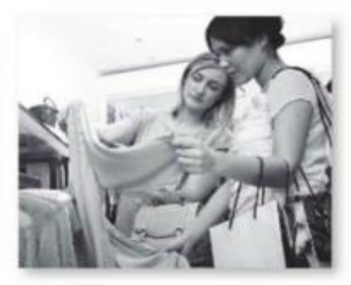
5. They're agoing to go shopping.