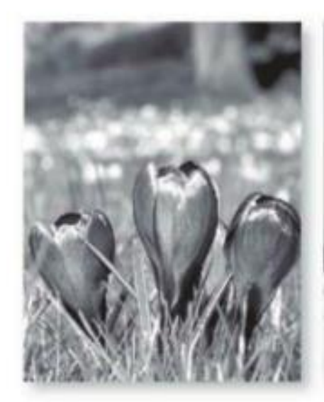
B When are the seasons in your country? Write the months for each season.