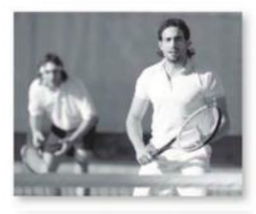
4. They are going to play tennis.