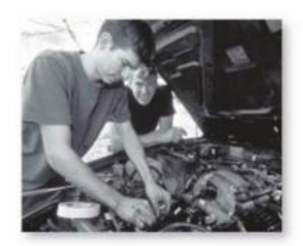
He's going to fix his friend's car.