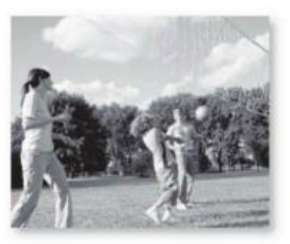
They´re going to play volleyball.