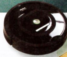
The iRobot Roomba vacuums.

How often do you clean your house? Once a week? Twice a month? Never? Well, these two robots clean the house for you. The iRobot Roomba® turns right or left, and vacuums while you watch TV or exercise. Take a nap, and the house is clean when you get up. And if you want to wash the floor, the iRobot Scooba® washes the floor for you. The Scooba moves around corners and washes the floor while you listen to music or check your e-mail. Now that's help with household chores!