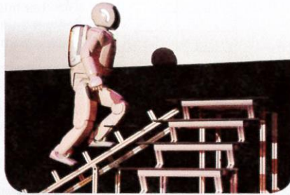
ASIMO climbs stairs...

And who is this? Meet ASIMO, a robot from the Honda Motor Company. ASIMO doesn't clean the house. It doesn't wash dishes or take out the garbage. But ASIMO walks, climbs stairs, carries things, and pushes things. ASIMO talks, answers questions, and follows directions. Ask, "What's your name?" and ASIMO says, "I'm ASIMO." Say "turn left" or "turn right," and ASIMO turns. ASIMO also greets people. Some people think ASIMO is very cute.