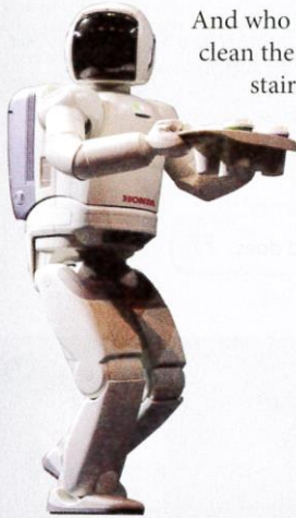
ASIMO carries a tray.

And who is this? Meet ASIMO, a robot from the Honda Motor Company. ASIMO doesn't clean the house. It doesn't wash dishes or take out the garbage. But ASIMO walks, climbs stairs, carries things, and pushes things. ASIMO talks, answers questions, and follows directions. Ask, "What's your name?" and ASIMO says, "I'm ASIMO." Say "turn left" or "turn right," and ASIMO turns. ASIMO also greets people. Some people think ASIMO is very cute.