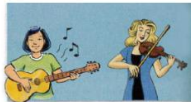
4. play the guitar/ the violin