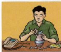
12. fix things