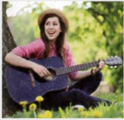
Carrie can play the guitar.

We use “can” or “can’t” + the base form of a verb to talk about ability.