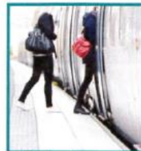
4. take the train