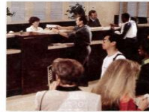
3. a bank