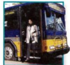
5. take the bus