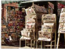
5. a newsstand