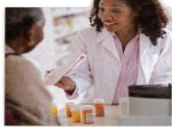
1. a pharmacy

a) Read and listen. Then listen again and repeat.