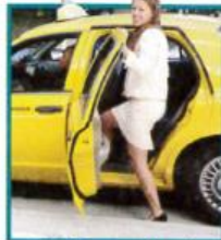
3. take a taxi