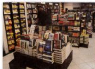
6. a bookstore