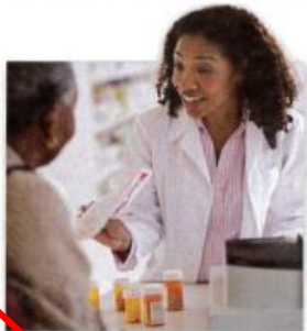
1. a pharmacy