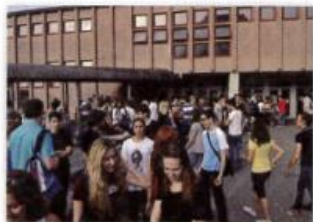
4. a school