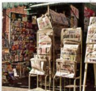
5. a newsstand