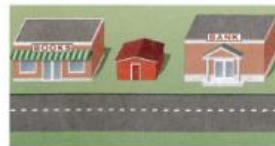
7. between the bookstore and the bank