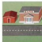
6. next to the bank