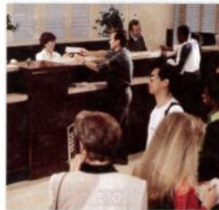
3. a bank