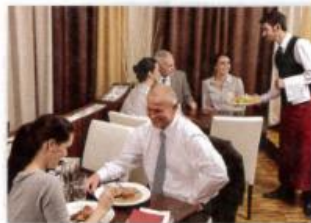
2. a restaurant