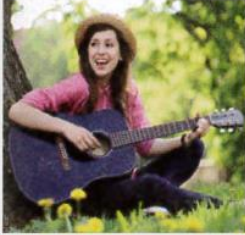
Carrie can play the guitar.

We use "can" or "can't" + the base form of a verb to talk about ability.