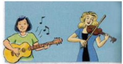
4. play the guitar/ the violin