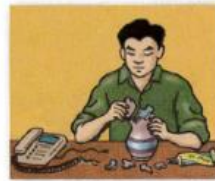
12. fix things