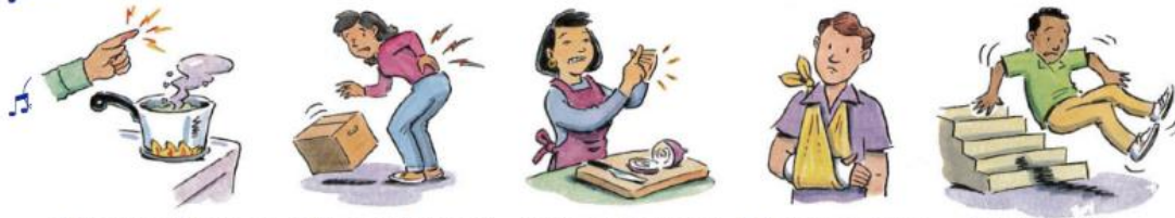
1. He burned his finger 2. She hurt her back 3. She cut her hand 4. He broke his arm 5. He fell down

i) 4.6 Read and listen. Then listen again and repeat.