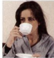
3. have some tea