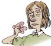
6. a cold