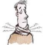
7. a sore throat