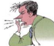
9. a cough