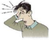
1. a headache