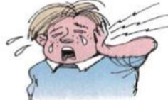
3. an earache