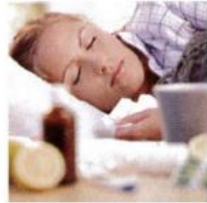
2. lie down