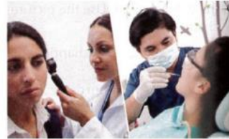
4. see a doctor/ see a dentist