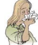
10. a runny nose