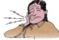
4. a toothache