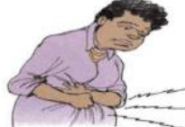
2. a stomachache