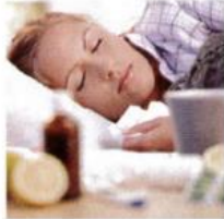
2. lie down