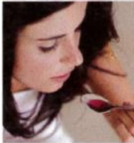
1. take something