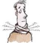
7. a sore throat