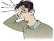
1. a headache