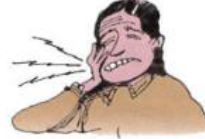
4. a toothache