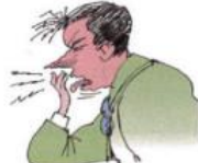
9. a cough