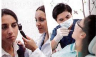
4. see a doctor/ see a dentist