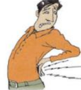
5. a backache