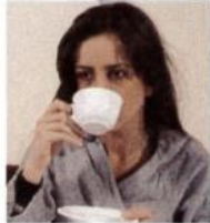
3. have some tea