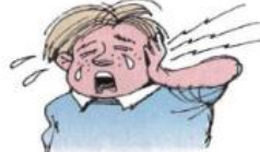
3. an earache