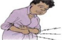
2. a stomachache