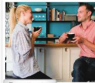
7. a coffee shop