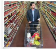
8. a supermarket