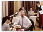
2. a restaurant