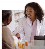
1. a pharmacy