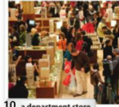
10. a department store