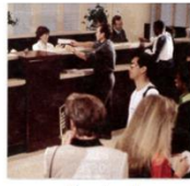
3. a bank