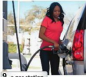
9. a gas station