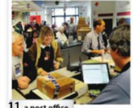
11. a post office

Exercise 1. Translate to Spanish the vocabulary above (Traduce al español el vocabulario de arriba).