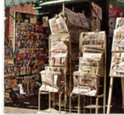
5. a newsstand