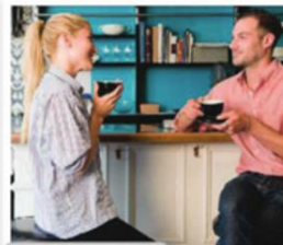
7. a coffee shop