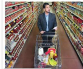
8. a supermarket