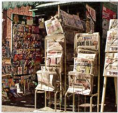
5. a newsstand