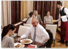
2. a restaurant