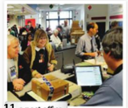
11. a post office

Exercise 1. Translate to Spanish the vocabulary above (Traduce al español el vocabulario de arriba).