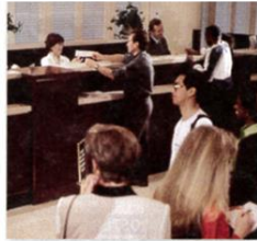
3. a bank