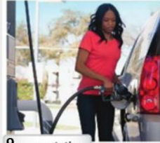
9. a gas station