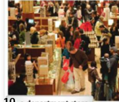
10. a department store