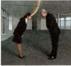
Some people bow.

People greet each other differently around the world.