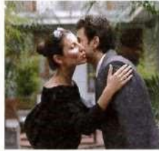
Some people kiss once. Some kiss twice.