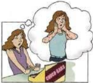
I'm allergic to chocolate.