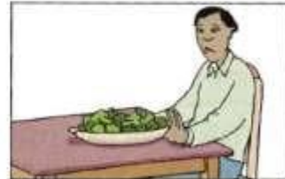
I don't care for broccoli.

Exercise 4. Escribe 7 oraciones usando las palabras en paréntesis .