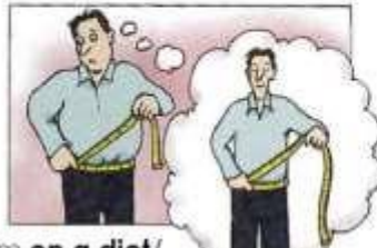
I'm on a diet / I'm trying to lose weight .