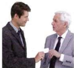
Other customs are informal. People accept a card with one hand and quickly put it in a pocket.