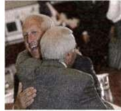
and some hug.