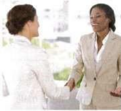
Some shake hands.