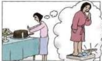
I'm avoiding sugar.