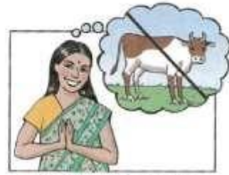
I don't eat beef. It's against my religion .