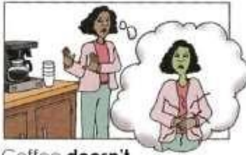
Coffee doesn't agree with me.