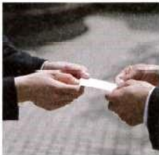
Some customs are very formal. People always use two hands and look at the card carefully.

People have different customs for exchanging business cards around the world.