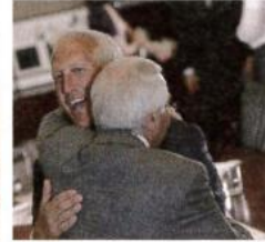
and some hug.