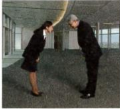
Some people bow.

People greet each other differently around the world.