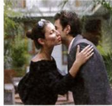
Some people kiss once. Some kiss twice.