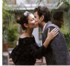
Some people kiss once. Some kiss twice.