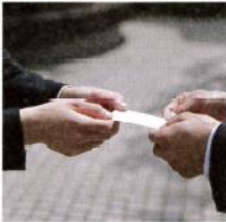
Some customs are very formal. People always use two hands and look at the card carefully.

People have different customs for exchanging business cards around the world.