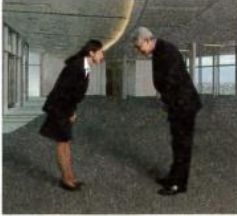
Some people bow.

People greet each other differently around the world.