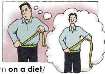
I'm on a diet / I'm trying to lose weight .