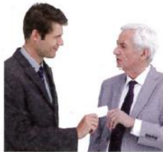
Other customs are informal. People accept a card with one hand and quickly put it in a pocket.