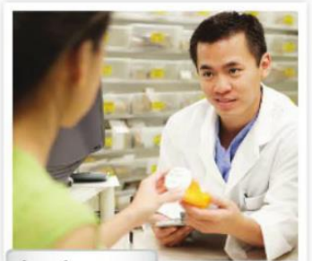
b. a drugstore