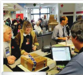
a. a post office