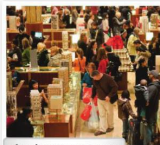
d. a department store