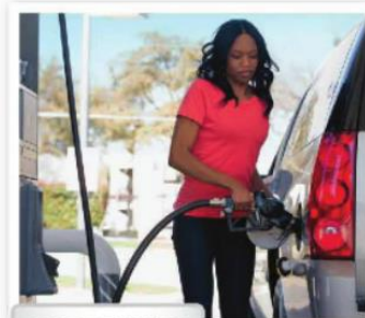
c. a gas station