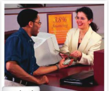
e. a bank