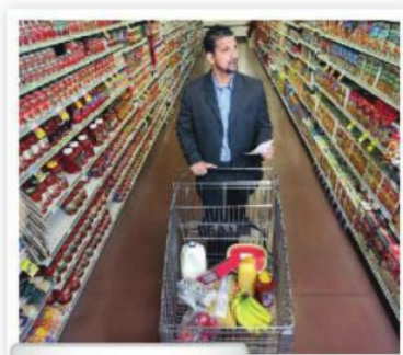
h. a supermarket

B PAIR WORK What else can you get or do in the places in part A?