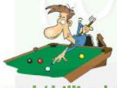
pool / billiards