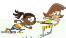
athletics (track and field)