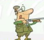
clay (target) shooting