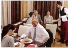
2. a restaurant