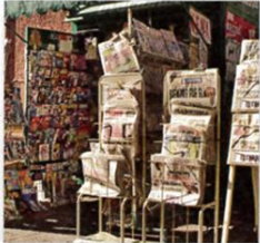
5. a newsstand