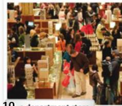
10. a department store