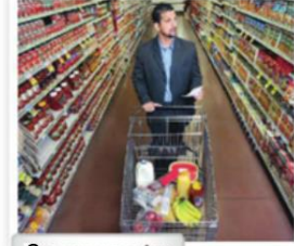
8. a supermarket