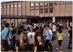
4. a school