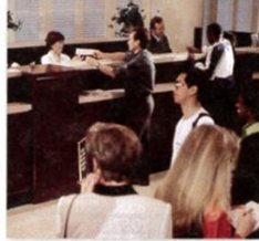
3. a bank