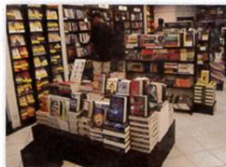
6. a bookstore