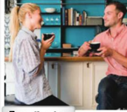
7. a coffee shop