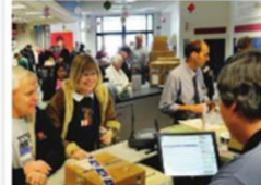
11. a post office

Exercise 1. Translate to Spanish the vocabulary above (Traduce al español el vocabulario de arriba).