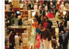
10. a department store