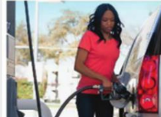
9. a gas station