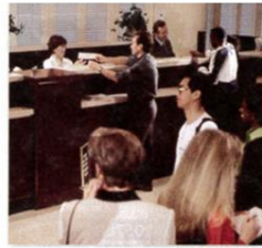
3. a bank