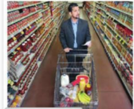
8. a supermarket