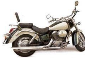
5. a motorcycle