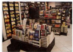
6. a bookstore