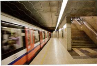
4. a subway