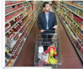
8. a supermarket