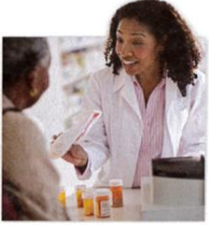
1. a pharmacy