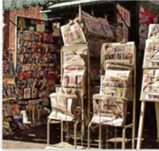
5. a newsstand