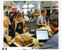
11. a post office

Exercise 1. Translate to Spanish the vocabulary above (Traduce al español el vocabulario de arriba).