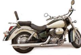
5. a motorcycle