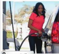
9. a gas station