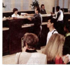
3. a bank