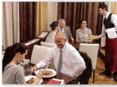
2. a restaurant