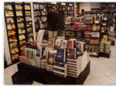
6. a bookstore