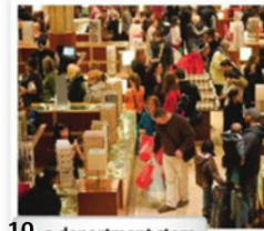
10. a department store