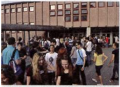
4. a school