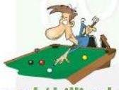
pool / billiards