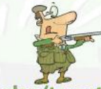
clay (target) shooting