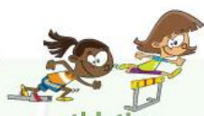
athletics (track and field)