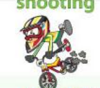
downhill mountain biking